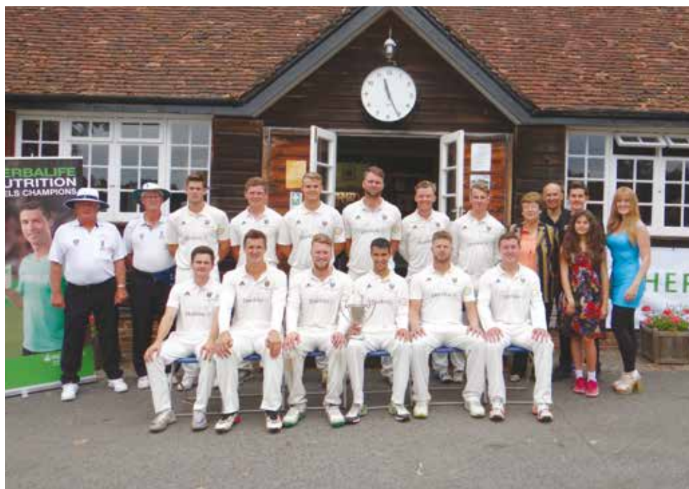
Old Cranleighans at Arundel 2018