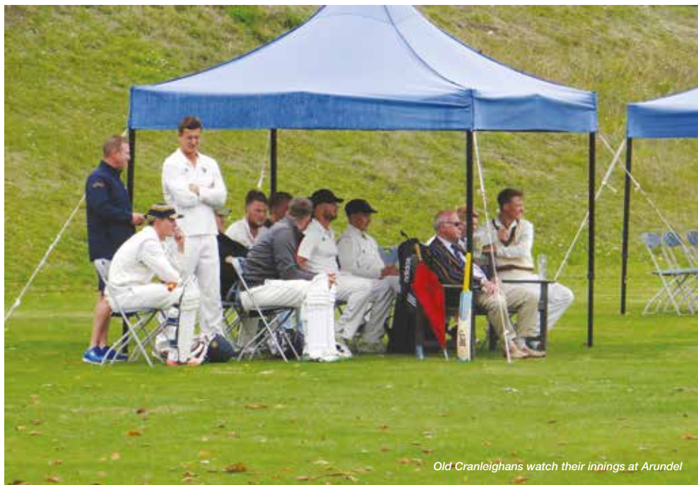
Old Cranleighans watch their innings at Arundel