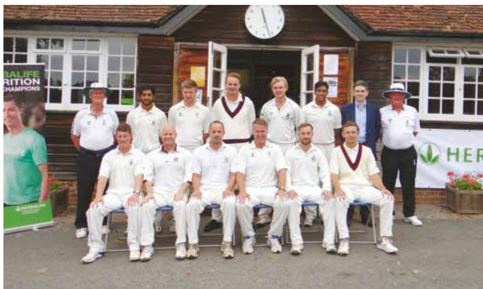
Old Malvernians at Arundel 2018